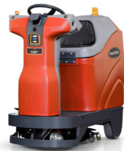
Compact and highly efficient machine for best cleaning results

RoboScrub 20, the autonomous cleaning machine of Hako's Minuteman brand, has already proven its efficiency in the field: from production halls and warehouses with many small aisles to large shopping centres. This machine ensures intuitive operation and safely navigates around complex environments. Obstacles identified by the camera systems are translated into commands by the BrainOS® technology – for example “circumnavigate obstacle” or “machine stop”. To carry out short interim cleaning applications, RoboScrub 20 can also be used as a conventional ride-on scrubber-drier.