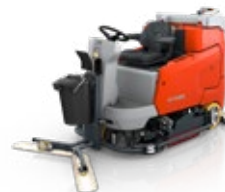
Pre-sweep tool "Mop" – option for Scrubmaster B175 R, B260 R and B400 R