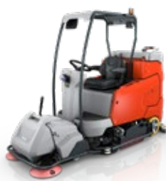
Pre-sweep/vacuum unit with DustStop – option for low-dust sweeping and reduced fine particulate development for Scrubmaster B175 R and B260 R