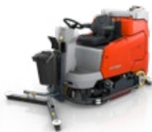
Pre-sweep tool "Broom" – option for Scrubmaster B175 R, B260 R and B400 R