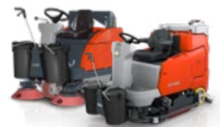
Tool "Light-debris collector" – option for Scrubmaster B175 R, B260 R and B400 R, and Sweepmaster 900 R and 980 R/RH

Hako Machines Ltd Eldon Close, Crick, Northampton NN6 7UD 01788 825600 enquiries@hako.co.uk www.hako.co.uk