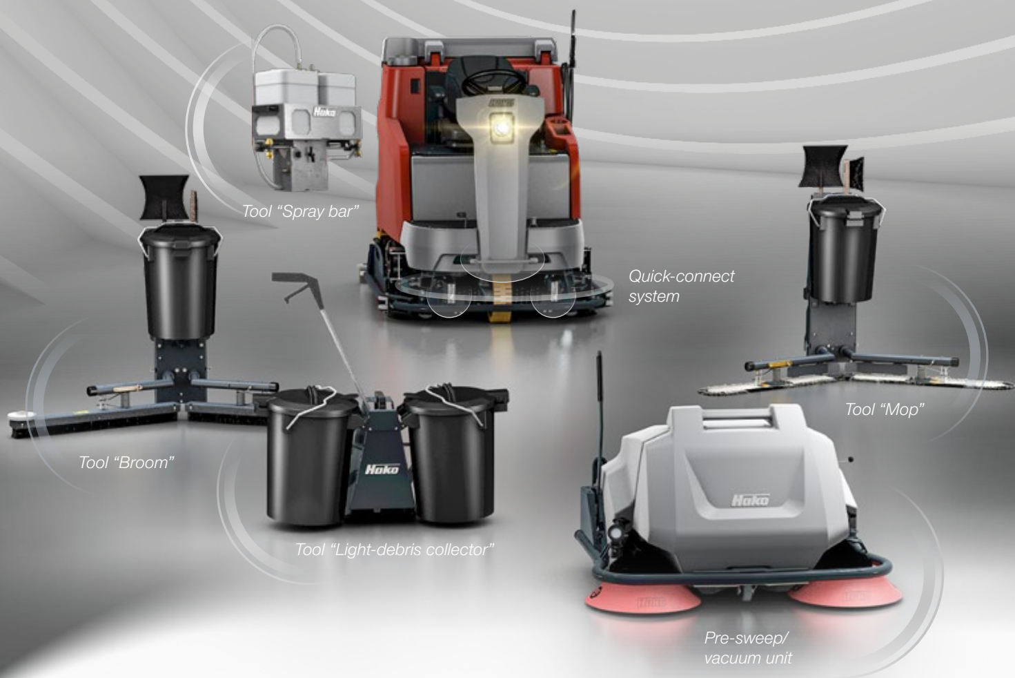
Tool "Spray bar"