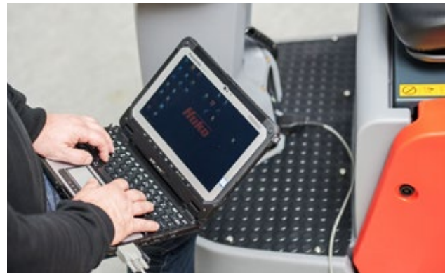
Easy access to the diagnosis interface for maintenance purposes and to modify machine settings.

We offer you attractive, customised rental and leasing options for more flexibility and cost-efficiency.