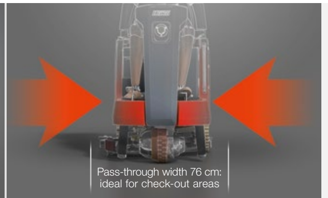
Pass-through width 76 cm: ideal for check-out areas