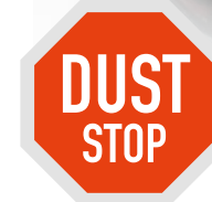
Pre-sweep unit with DustStop