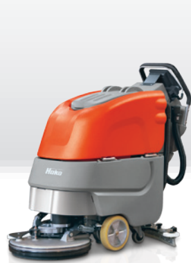
Scrubmaster B30 / CL