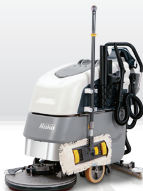
Scrubmaster B45 CLH