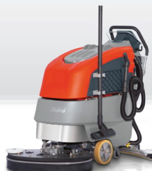
Scrubmaster B45 CL