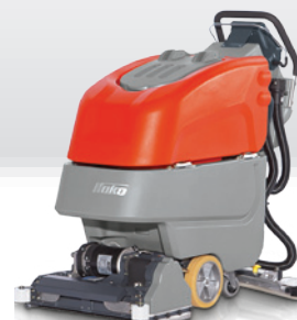
Scrubmaster B45 CL WB