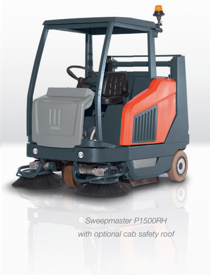
Sweepmaster P1500RH with optional cab safety roof